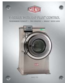
V-Series with E-P Plus® control