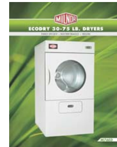
EcoDry 30-75 lb. Dryers